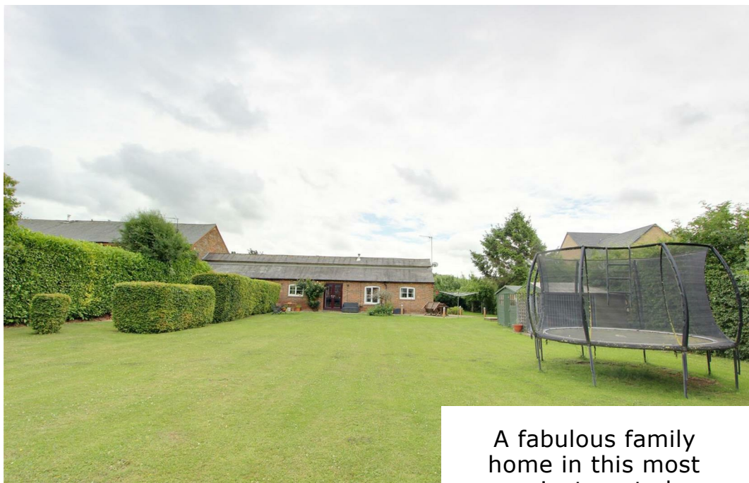
A fabulous family home in this most private gated development.